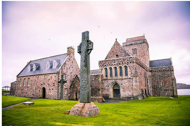
Image of Iona Abbey